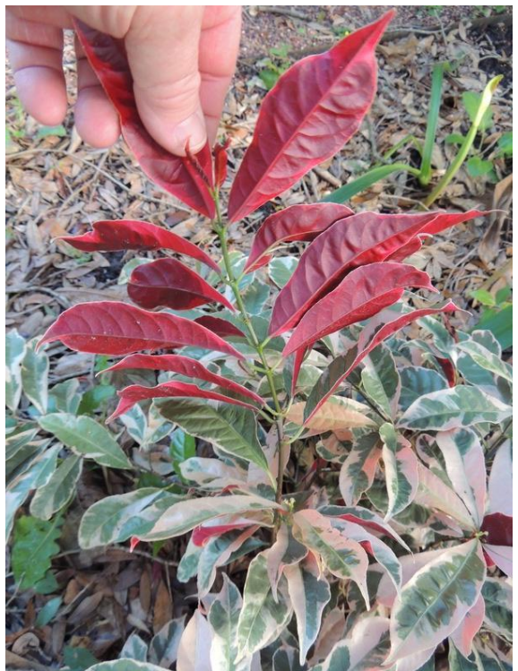
Chinese Croton.

2a) Observe the Chinese Croton ( Excoecaria cochinchinensis 'firestorm'). It usually grows under shade. Explain how it adapts to grow under shade by first describing the colour of its leaves and then discussing its adaptation. Pen your ideas in the box provided.