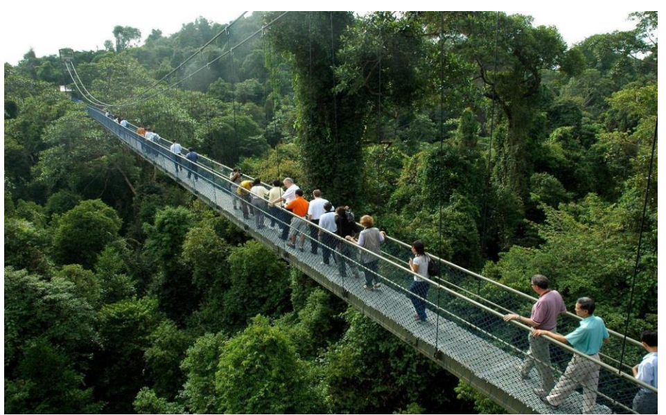
Tree Top Walk at MacRitchie Reservoir.