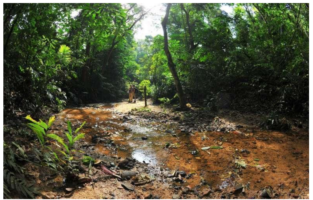
Rainforest in Singapore.

The following are factors that affect the rate of decomposition at the forest floor.