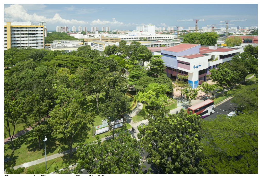
Greenery in Singapore.

Look at the greenery around you! Yes, tropical rainforests are found near the equator in a climate similar to Singapore's.