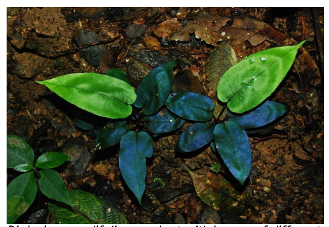
Diplazium cordifolium, a plant with leaves of different colours.

Purple leaves usually have high anthocyanin concentration relative to chlorophyll. Since anthocyanin absorbs green light and reflects red and purple light, the leaves appear purple to our eyes. Chlorophyll is present but masked by the higher concentration of anthocyanins.