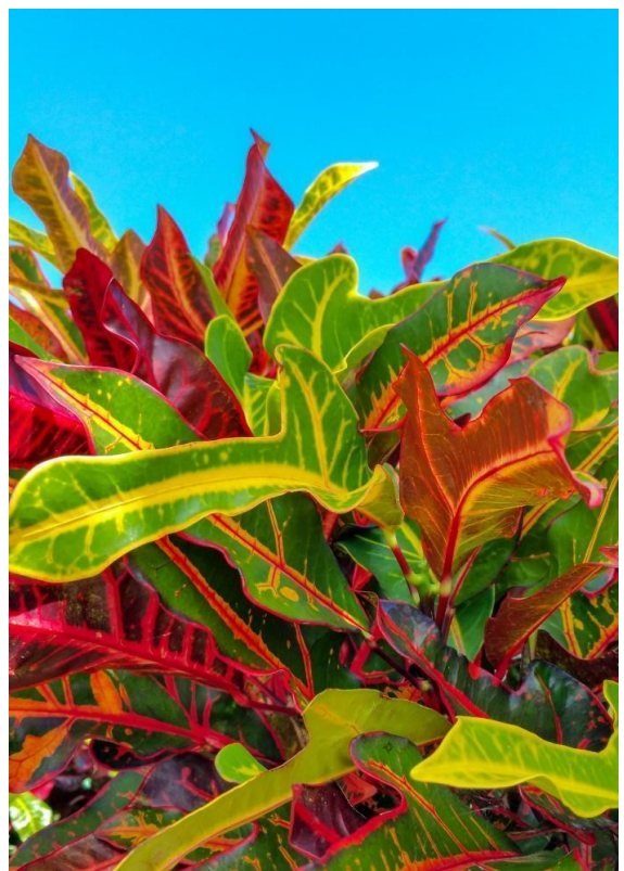
Garden Croton.

Refer to the picture of the Garden Croton provided above.