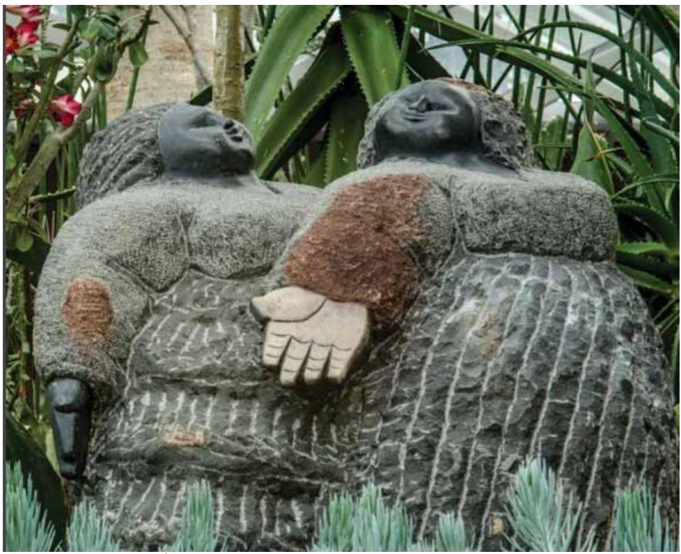
Parting by sculptor Colleen Madamombe Art in the Conservatories – Sharing and Activity Sheet © Gardens by the Bay 2020

The first sculpture that we will observe is Parting by Zimbabwean sculptor, Colleen Madamombe. Observe the picture below and describe what you see using the questions below as a guide.