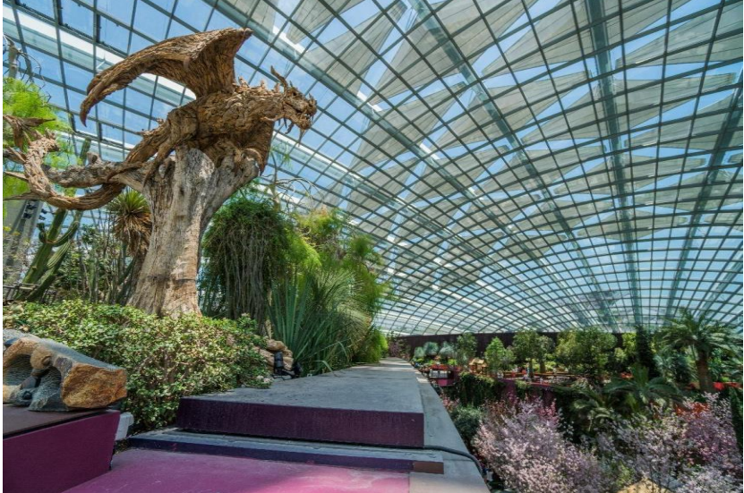
The Wyvern, a sculpture in Flower Dome