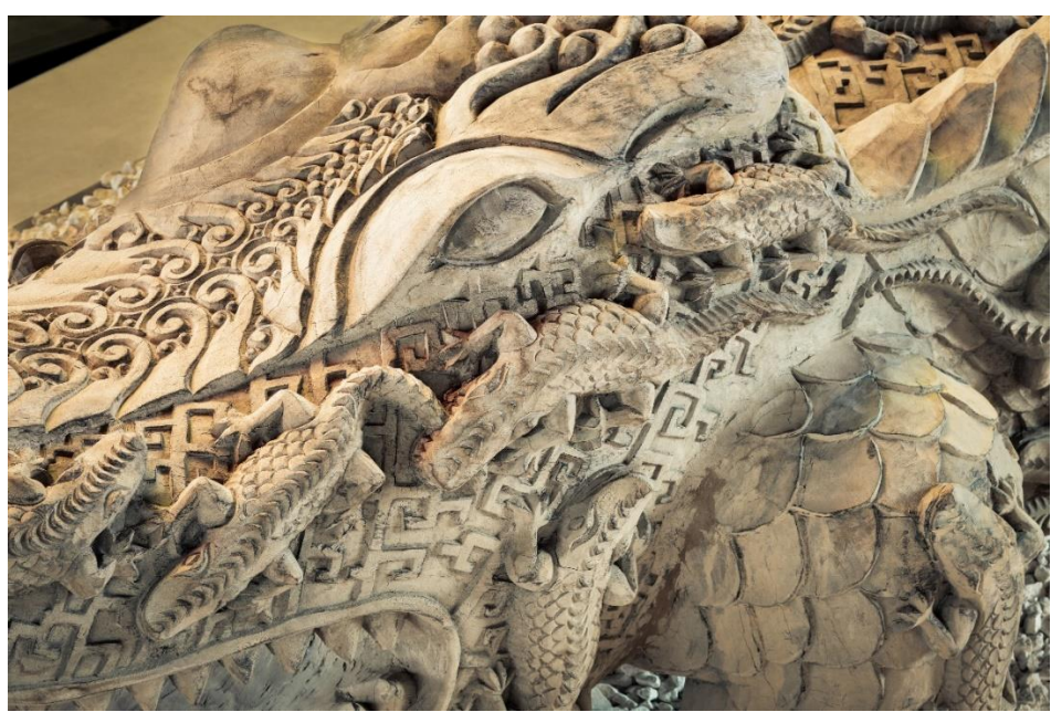
Mama Gaya Crocodile